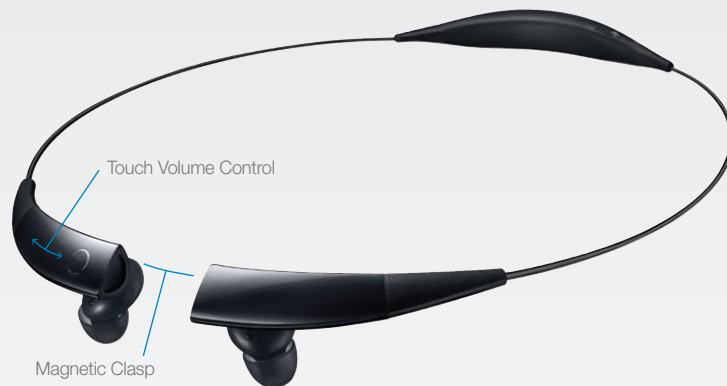
Convenient and Fashionable Around-the-Neck Design with Magnetic Front Clasp

Keep your tunes close by and ready to go with the wearable Samsung Gear ™ Circle. The unique design of the Gear ™ Circle keeps your music and your calls conveniently around your neck. Use the touch volume controls to crank up the high quality wireless sound and the Gear Manager Mobile App for custom sound adjustment and device management. Intuitive music and call features, a light-weight, sweat-resistant design and exceptional battery life make Gear ™ Circle perfect for the long distance runner or the music enthusiast on the go.