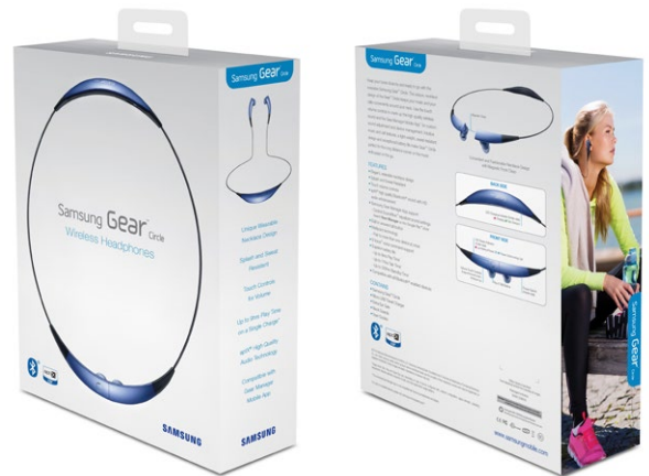
Gear Circle Retail Package (Blue)