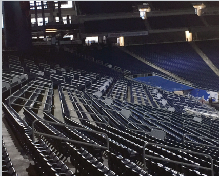
Multiple Handrail Enclosures installed in the lower bowl of the stadium