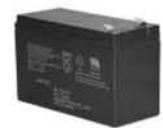
7.2Ah Battery AX-STDBAT-7 AX-LONGBAT-7