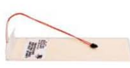
Battery Heater MPS-CWK-120/240