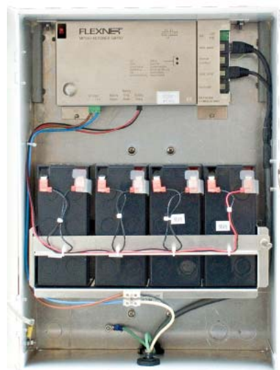
Front view MPS48-7C shown with batteries and AC service installed