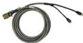
MPS48-7C to Radio CBL-UPS-CA-5/15