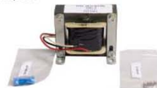
Step-down Transformer UPS-SDXB