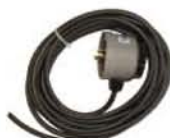
Streetlight AC Tap CBL-UPS-SL-25